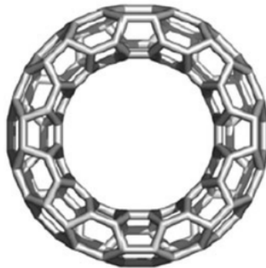
Figure 1. A toroidal fullerene (or achiral polyhex nanotorus) T[p, q] .

A nanostructure is an object of intermediate size between molecular and microscopic structures. It is a product derived through engineering at the molecular scale. In what follows, we aim to apply Corollary 2.5 to the molecular graph of a nanostructure called toroidal fullerenes (or achiral polyhex nanotorus) (see Figure 1 and Figure 2).